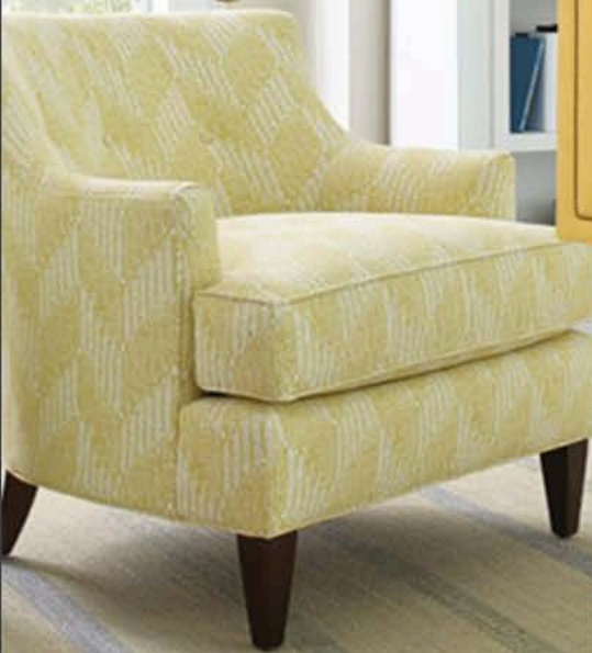
Concert Hall by Lees Studio 1846